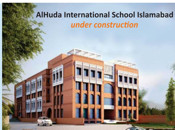
AlHuda International School Islamabad under construction

For other details and queries please contact: 051-4866125- 9, 4866197 (8:30 am to 2:00 pm) Cell: 0312- 5255688 Email: swd.alhuda.isb@gmail.com Website: www.alhudapk.com