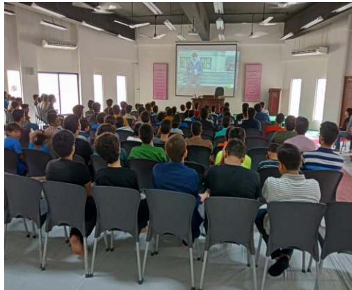
Summer Course for boys