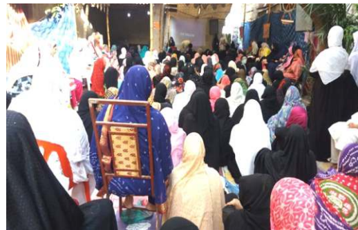
Hajj Training in Karachi

Every year Al-Huda conducts Hajj Training workshops all over Pakistan. This year, Al-Huda was given the opportunity to conduct Hajj Training at Hajj Camp Karachi. About 1000 men and women attended this workshop daily. Free dua books were also distributed among the intended pilgrims.