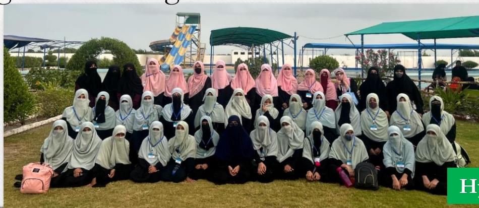
Hyderabad Hostel Students